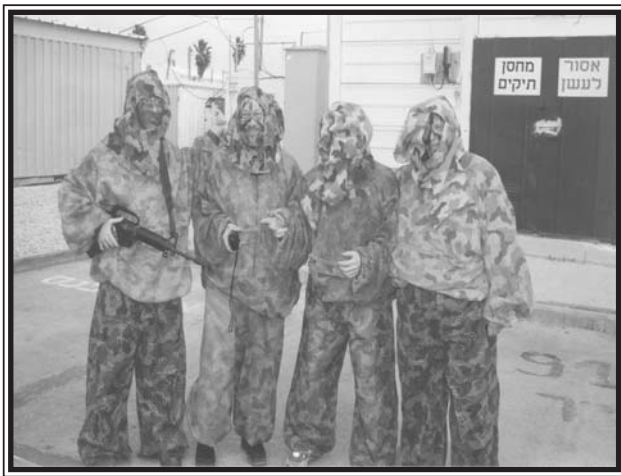
"Can you tell who each person is?"